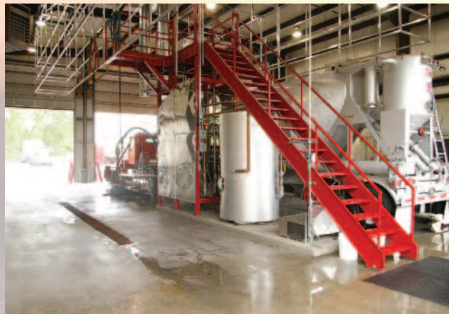
Modern two bay tank wash facility, both in Minneapolis, MN and St. Louis, MO