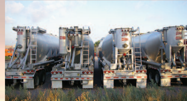
Modern Self Loaders