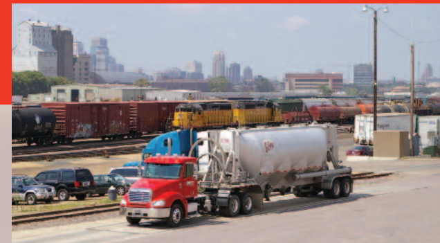
Bulk Truck Scaling in Minneapolis, MN