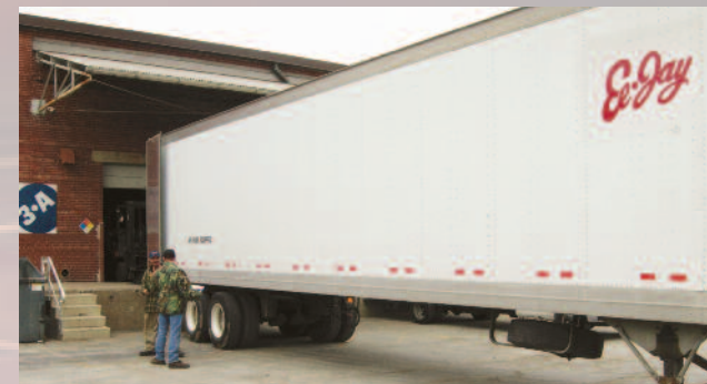
Van Trailer Loading at a Warehouse