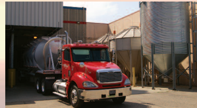
Delivery at End-User's Facility